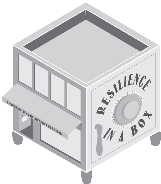
RESILIENCE IN A BOX 2017 ©

After a disaster, the community is relying on your goods, products, and services. Also, you and your employees are relying on revenue for paychecks. Connect with local Economic Development offices and Chambers of Commerce to help spread the word that you are open for business. Find creative ways to make your business stand out, especially if you are hard to find due to damage in surrounding areas. Be flexible and look for possible temporary locations to go where potential customers are. Get engaged with community and recovery organizations to help bring back the community. Your involvement will highlight needs your business may be able to address. Your efforts can help the community to recover, too.